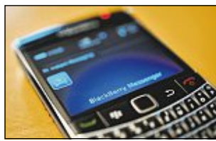
A BlackBerry smartphone runs the "Messenger" service in Berlin.

Meanwhile, emails and messages from other regions to Europe were piling up in RIM's systems in the rest of the world, like letters