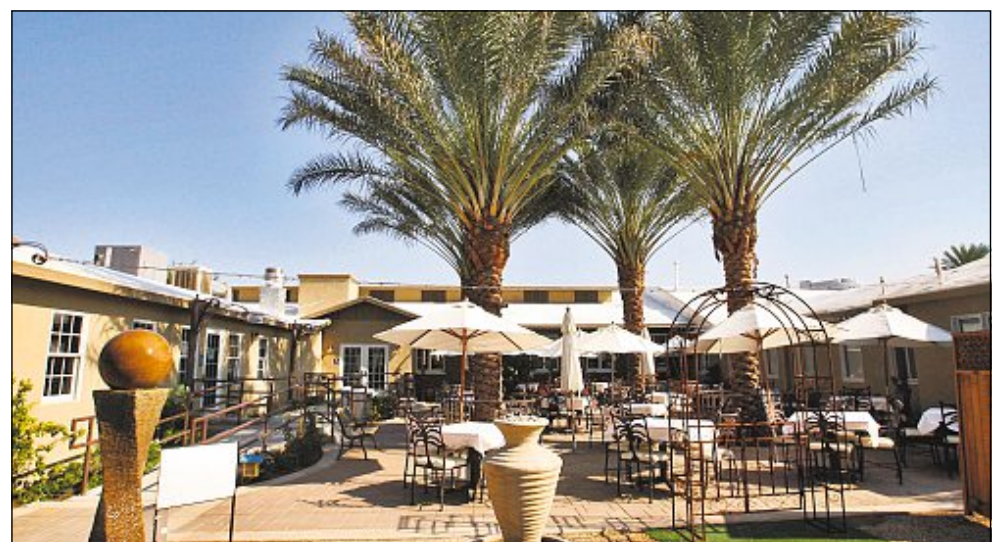
The Shields Date Gardens patio restaurant is photographed on September 15, 2011.