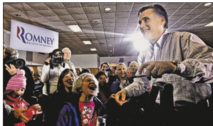
Former Massachusetts Gov. Mitt Romney campaigns for the Republican presidential nomination at the Mississippi Valley Fairgrounds on Monday in Davenport, Iowa.