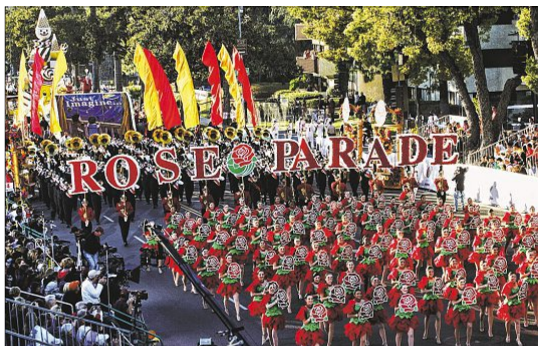
Performers with the Wells Fargo theme float "Just Imagine..." move along Orange Grove Boulevard during the 123rd Tournament of Roses Parade on Monday in Pasadena. Occupy protesters also participated in the event. Read the story on A4.