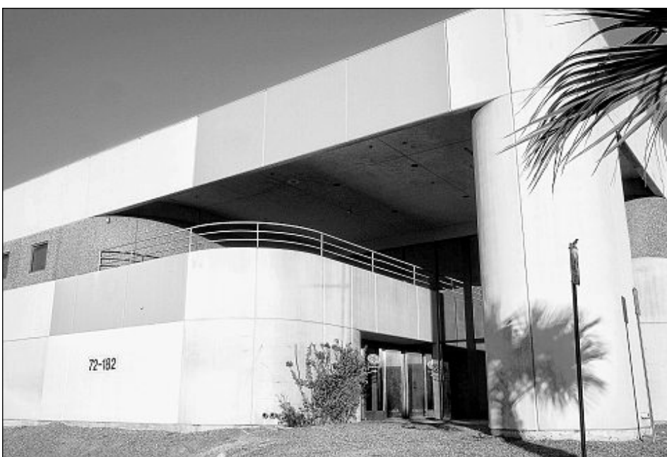
This structure at 72-182 Corporate Way in Thousand Palms, inside the Coachella Valley Enterprise Zone, is the new home of the Tala Enterprise warehouse, with a workforce of 31.

With the Coachella Valley's unemployment rates still at their highest levels since spring 2009, the jobs that such manufacturing businesses can provide are