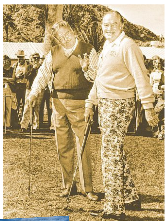
Jackie Gleason jokes with Bob Hope during the 1978 Bob Hope Chrysler Classic.