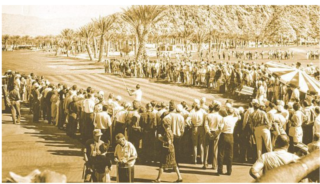
Arnold Palmer tees off in the Bob Hope Chrysler Classic in this photograph from the mid-1960s.