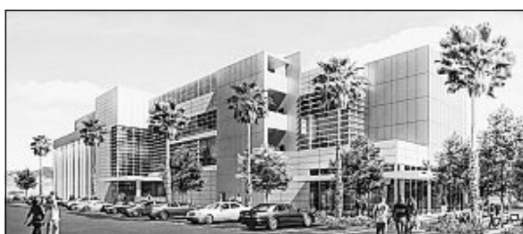
Construction of the College of the Desert Indio campus is scheduled to start in March 2012 and end in 2013.