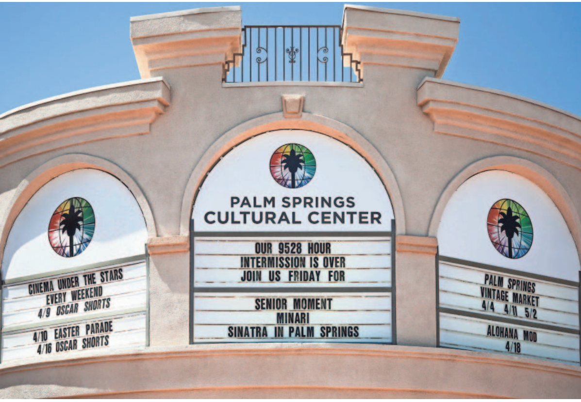
The Palm Springs Cultural Center will reopen its movie theaters Friday. Plexiglass is installed at ticketing booths and concession stands, and staff will be wearing masks. Spray cleanups will take place between screenings.